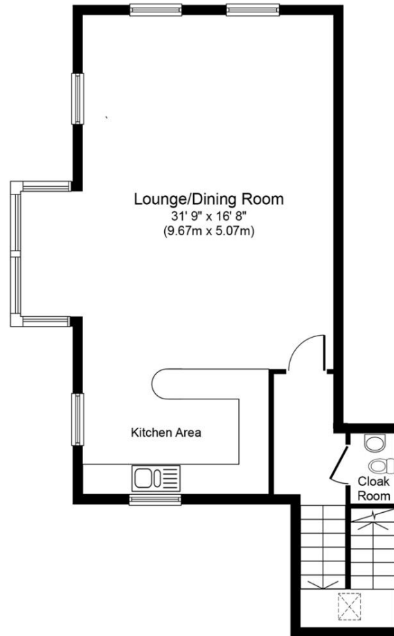
First Floor Approximate Floor Area 624 sq. ft. (58.0 sq. m.)

PLAN NOT TO SCALE FOR GUIDANCE PURPOSES ONLY