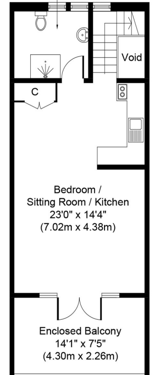
Boat House - First Floor Approximate Floor Area 434 Sq. ft. (40.3 Sq. m.)

Whilst every attempt has been made to ensure the accuracy of the floor plan contained here, measurements of doors, windows, rooms and any other items are approximate and no responsibility is taken for any error, omission, or mis-statement. The measurements should not be relied upon for valuation, transaction and/or funding purposes. This plan is for illustrative purposes only and should be used as such by any prospective purchaser or tenant. The services, systems and appliances shown have not been tested and no guarantee as to their operability or efficiency can be given.