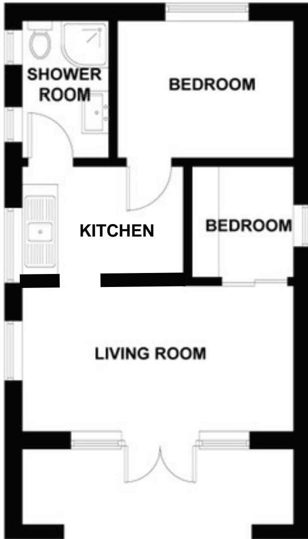
PLAN NOT TO SCALE FOR GUIDANCE PURPOSES ONLY